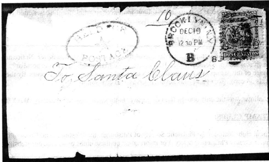
"A COVER ADDRESSED TO SANTA CLAUS IN THE 1880'S 6 DAYS BEFORE CHRISTMAS USING A "USED" STAMP FROM PERU (SCOTT #106) 6 DAYS BEFORE CHRISTMAS. "HELD FOR POSTAGE" WHY?"

When you were young did you ever write a letter to Santa Claus telling him how good you have been and that you would like to have him bring the things listed in the letter on Christmas? Of course, these letters and their envelopes (covers) were, if mailed, most likely destroyed by the post office. Maybe your Mom or Dad said they mailed them, never did, but opened them to see what you asked for and bought them for you. In any case, not very many survived. In my travels to stamp shows, I have never seen any, but I did spot some on the Internet Auction site eBay and was fortunate to have won them. Below are images (reduced in size) of two elusive examples that I have. Covers to Santa, Father Christmas, etc, almost never had a return address because, after all, he "knew where you lived".